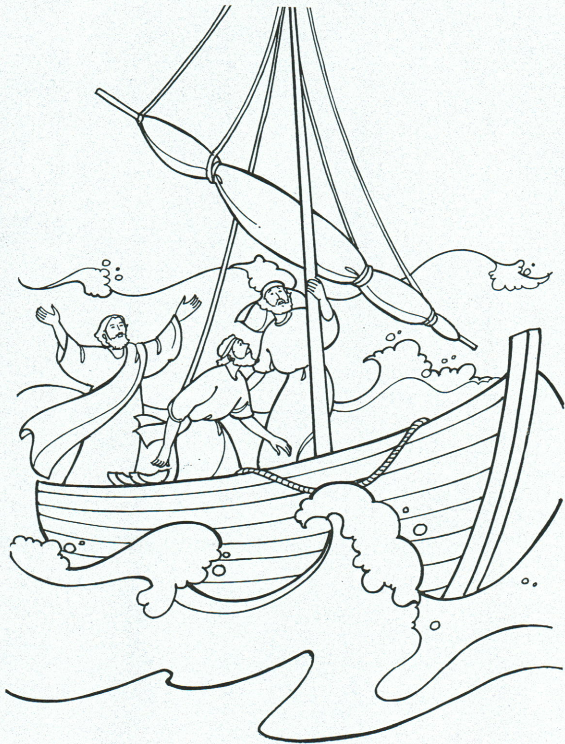
Jesus Stops a Storm