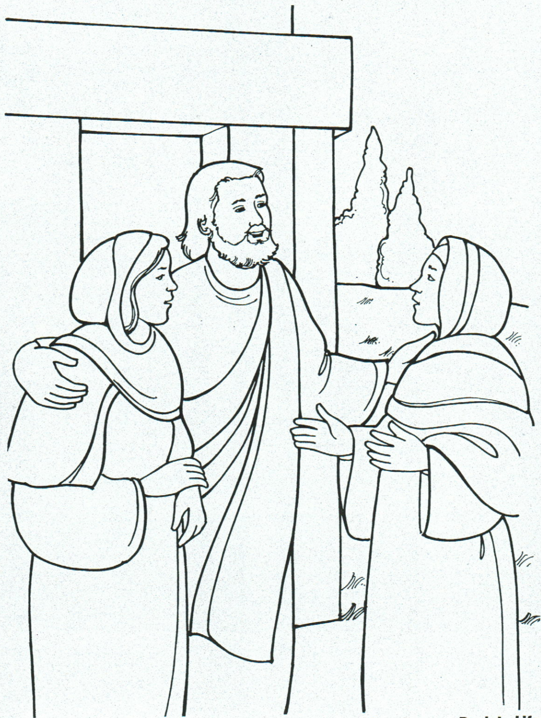
Jesus Brings Lazarus Back to Life